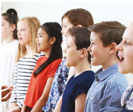
01420 88222 www.rpbooks.co.uk rp@rpbooks.co.uk @redemptorist

God of those who sing in hope, let us sing of the joy and possibility of your Holy Spirit. May we sing out your peace, alongside those who care about your creation, and in that singing may we find our common bond as creatures in your kingdom of hope and delight.