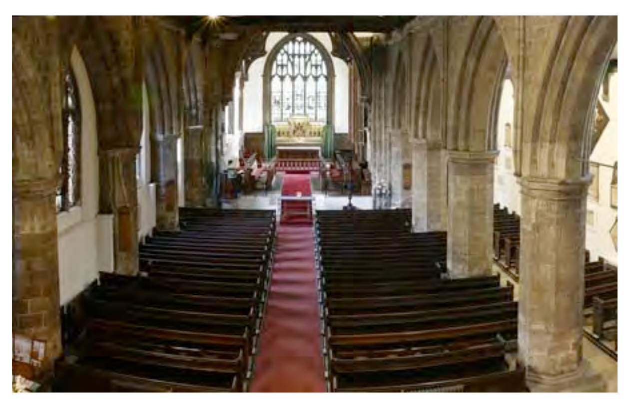
The Nave is the main central area where people worship.