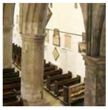
Aisles are spaces along each side of the Nave, usually separated from it by columns.

Holy Trinity only has a South Aisle left.