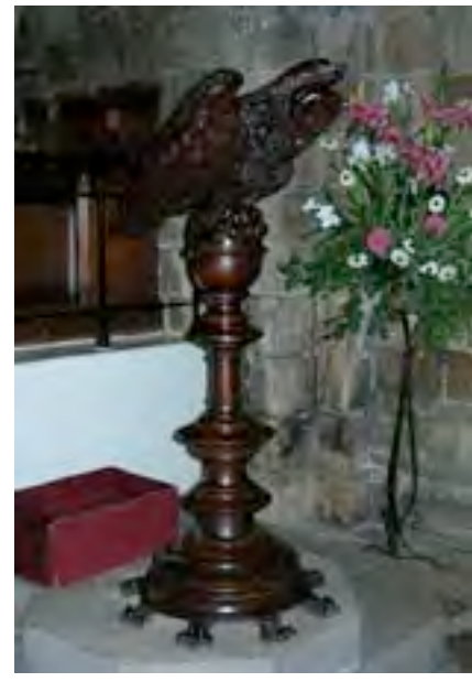
The lectern is a special desk from where the Bible is read during services.