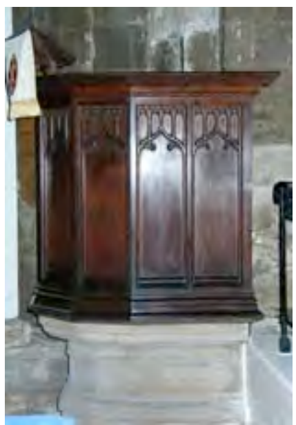
The Pulpit is a tall stand from where the priest will preach a sermon to the people.

The Altar is the table used when Christians share bread and wine in the Communion service.