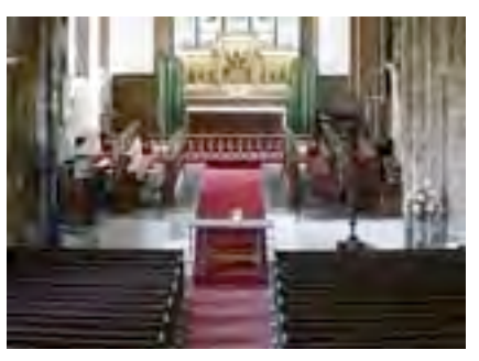
The Chancel is the part between the altar and the nave, used by the choir and clergy, often separated from the Nave by steps or a screen.